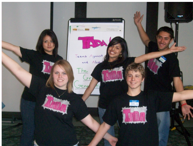
TADA youth who performed the skit.